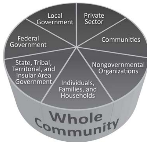
Figure 2: Composition of the Whole Community

capabilities—making these investments an increasingly effective, cost-efficient, and sustainable approach for the whole community to build resilience.